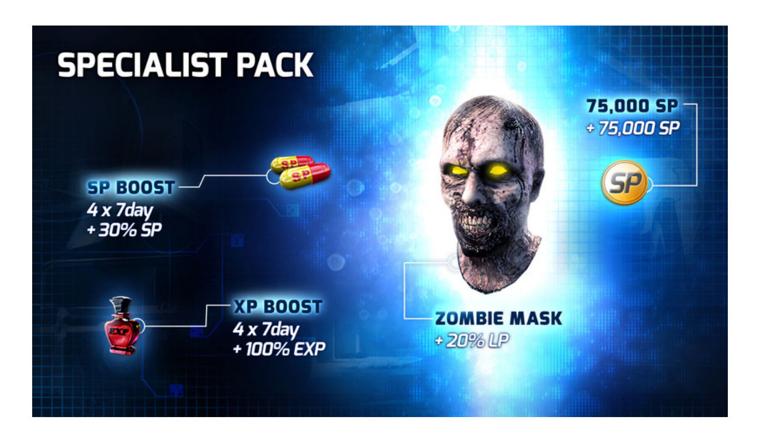
S.K.I.L.L. - Special Force 2 - Specialist Pack Crack 32 Bit

Download ->>->> <a href="http://bit.ly/2SJTX3y">http://bit.ly/2SJTX3y</a>